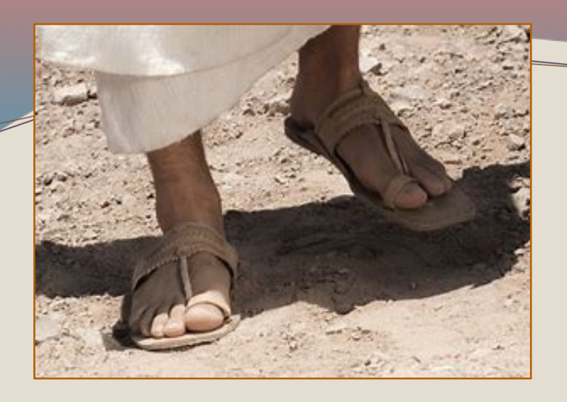
Moses—Lesson 3 (part 2) END

Responding to our "Burning Bush" Moments