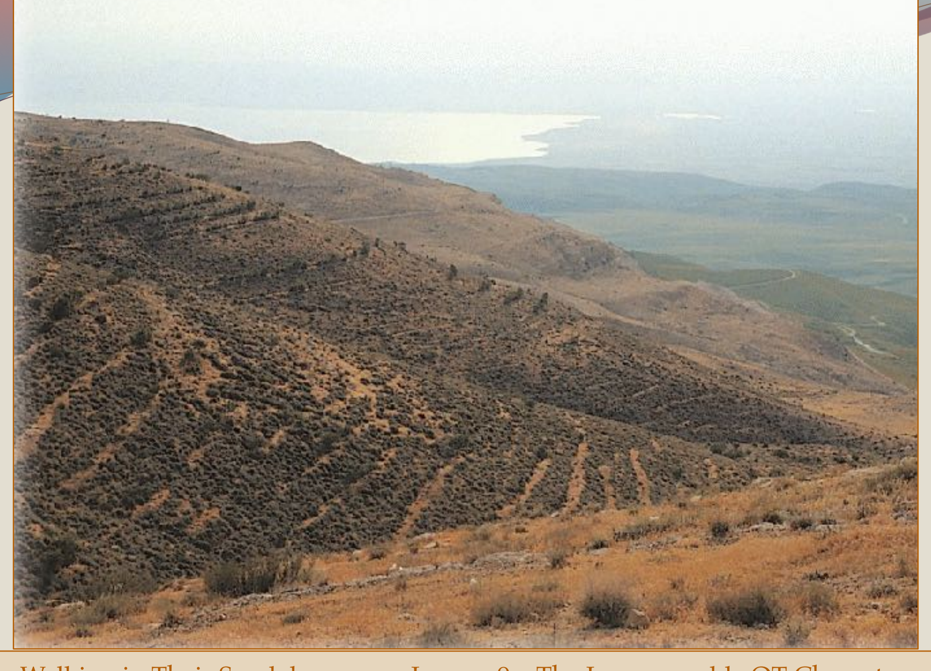
Walking in Their Sandals