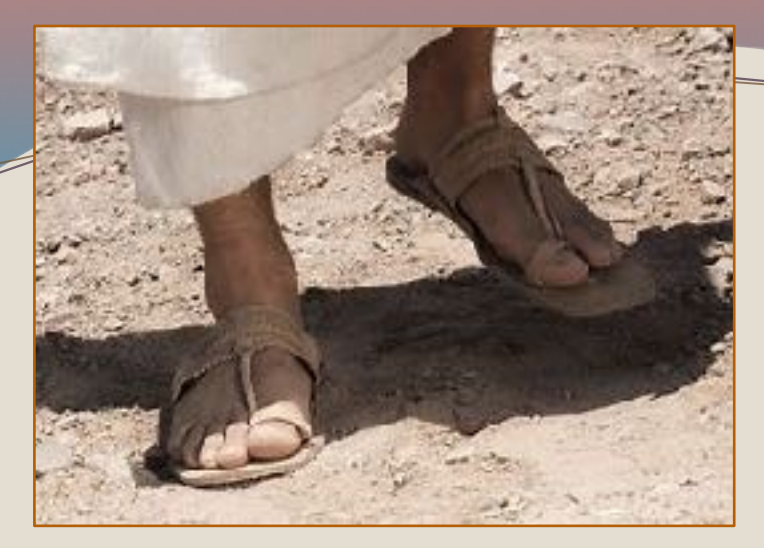
Biblical Character Sketches