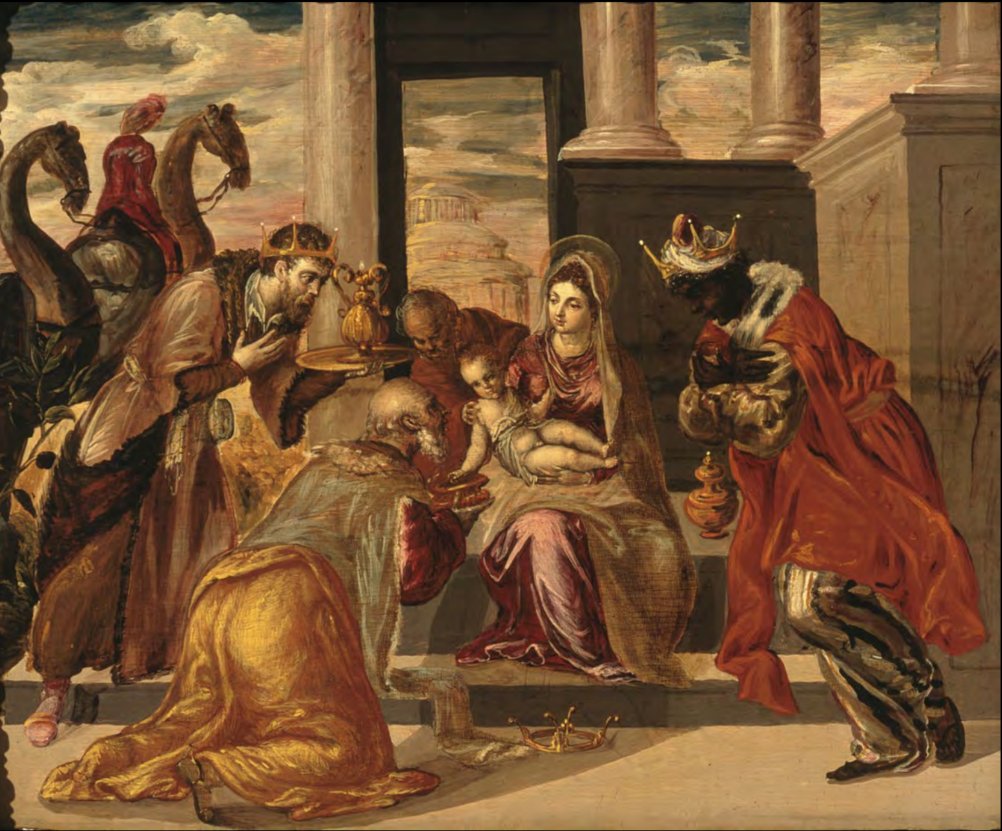
The Adoration of the Magi By El Greco Cir 1568