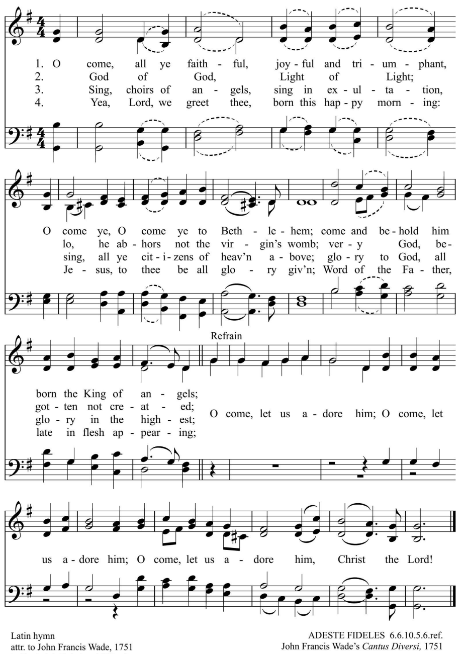
* Praising God in Song