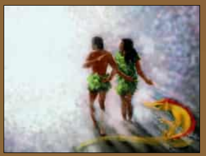
Illustrations from "Free Bible Images", by Carolyn Dyk – Wycliffe Bible Translators