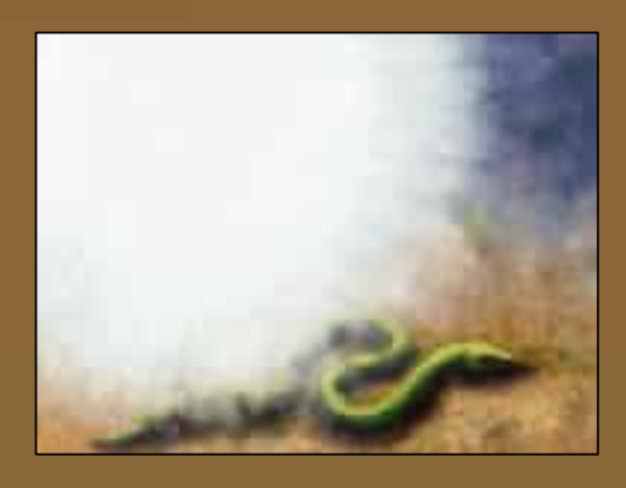
Illustrations from "Free Bible Images", by Carolyn Dyk – Wycliffe Bible Translators

The enmity between the serpent and the Seed (3:15)