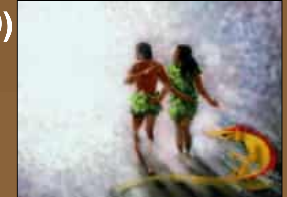
Illustrations from "Free Bible Images", by Carolyn Dyk – Wycliffe Bible Translators

☐ "What is this that thou hast done?" (3:13)