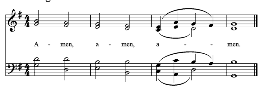
* Those who are able, please stand