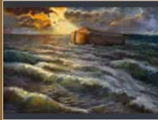
Illustrations from "Free Bible Images"