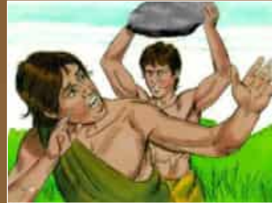
Illustrations from "Free Bible Images", by Jim Padgett

What is a key point that you may have learned from this lesson?