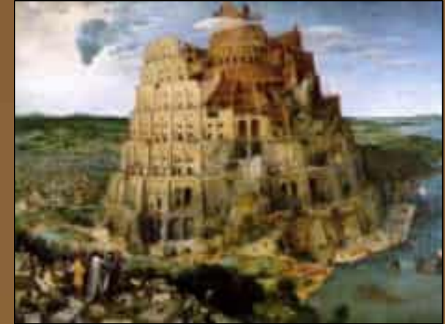
The Tower of Babel, Pieter Brueghel the Elder (1563)

“The True Story of the Old Testament”, Adult Bible Study Leader’s Guide, 2014, Regular Baptist Press, p.32