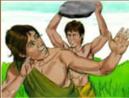
Illustrations from "Free Bible Images", by Jim Padgett