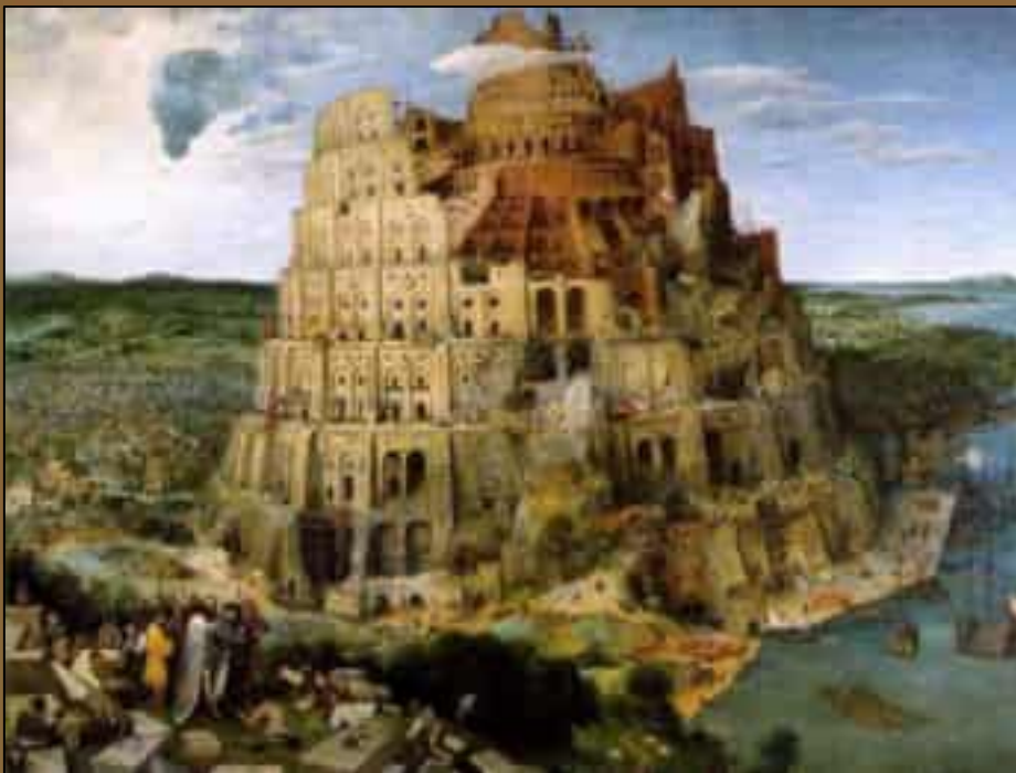
The Tower of Babel, Pieter Brueghel the Elder (1563)

“During Peleg’s day, the nations were divided by multiple languages (Gen. 10:25).