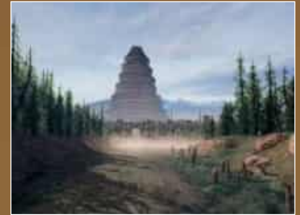
Illustrations from "Free Bible Images", by Jeremy Park – Bible-Scenes.com