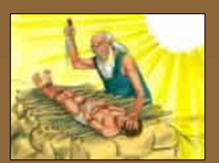
Illustrations from "Free Bible Images", by Jim Padget