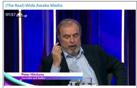
EPIC: Peter Hitchens masterfully exposes the farcical nature of Net Zero, to the absolute dismay of BBC Question Time panellists and

I recently read that the technocrats are now starting to push for restrictions on urban or backyard gardening.[6] They say it creates too much carbon. You know, this world could not exist without carbon. Net zero cannot be achieved without negatively impacting the world. More and more true thinkers/scientists are coming out to expose the fallacies of "climate change."