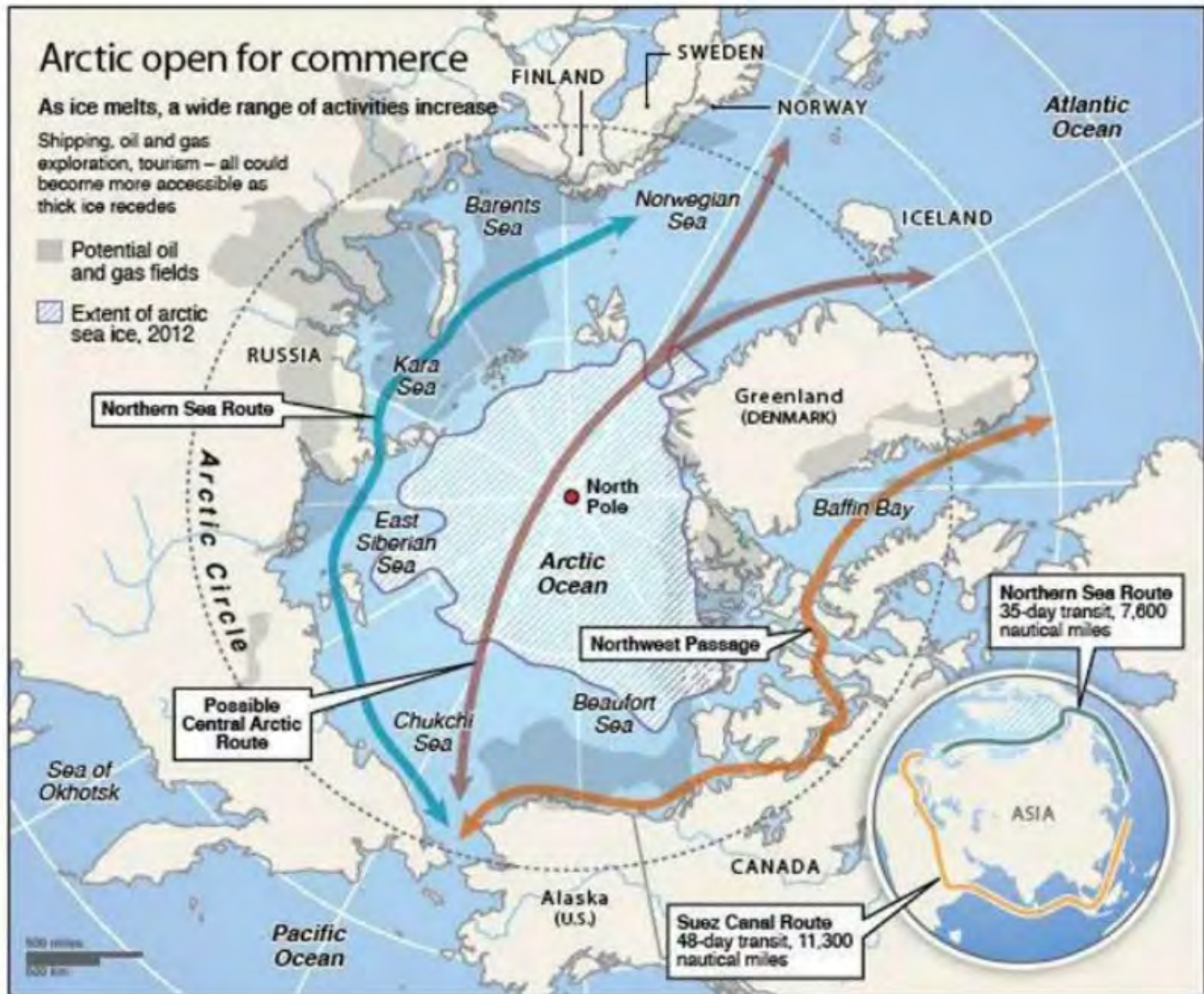
The Northern Sea Route.