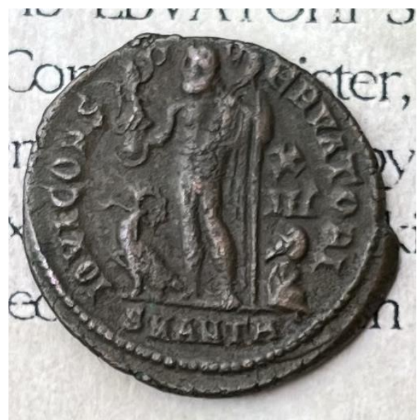
308-324 - Coin of Licinius II, Roman Emperor in the East (308-324). REV: The god Jupiter standing between an Eagle and a Captive