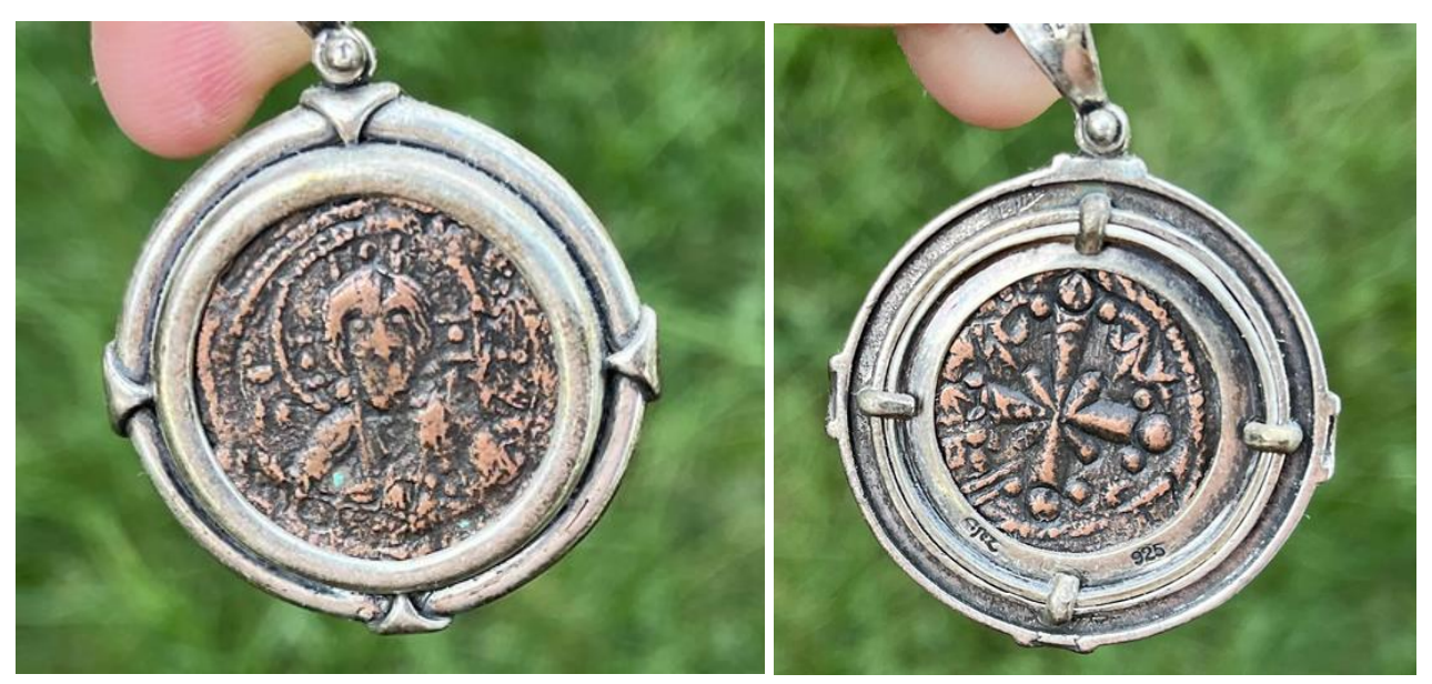
900 AD Byzantine bronze coin with Christ face on obverse side. REV: the Greek letter Chi, or X, over a cross. The "Chi" was the first letter of the Greek word christos (or, English "Christ")

995-1025 AD - Ancient Byzantine Bronze anonymous follis with bust of Christ during the reign of Basil II AD 995-1025. Ancient Byzantine Bronze coin Nimbate (or, haloed) bust of Christ, holding Book of Gospels Reverse: Inscription in four lines in Latin: +IhSuS XRISTUS bASILEu bASILE JESUS CHRIST KING of KINGS translate Jesus Christ king of the kings.