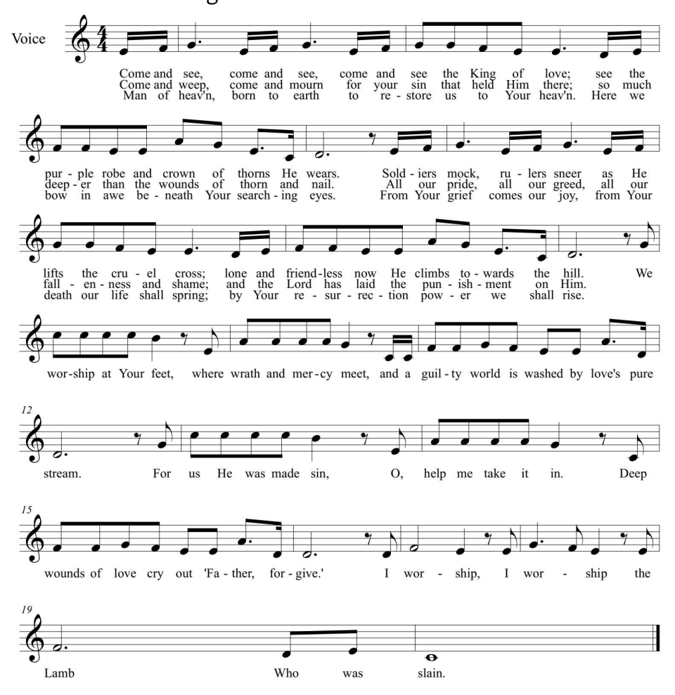
Words & Music by Graham Kendrick CCLI 82151