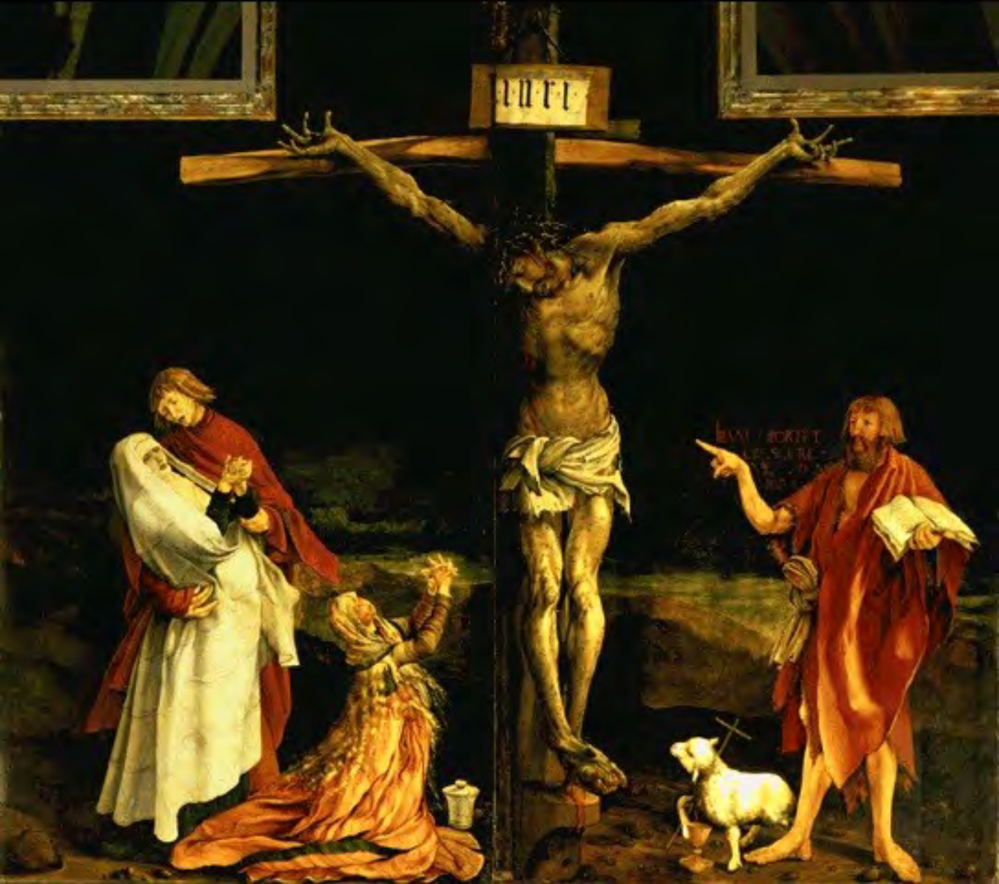
The Crucifixion by Matthias Grunewald Cir 1510-15