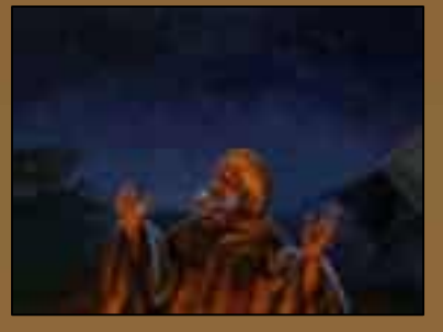
Illustrations from "Free Bible Images", by Jan van 't Hoff - Gospelimages