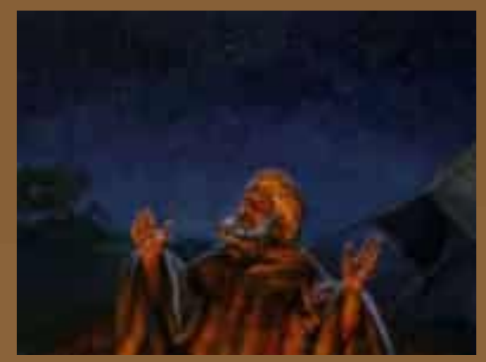
Illustrations from "Free Bible Images"

"God changed Abram's name (Gen.17:5) from Abram ("exalted father") to Abraham ("father of a multitude").