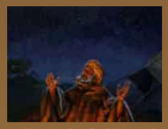
Illustrations from "Free Bible Images"

Abram was now 99 and Sarai was 89, so that in the natural all hope of their becoming parents was utterly gone."