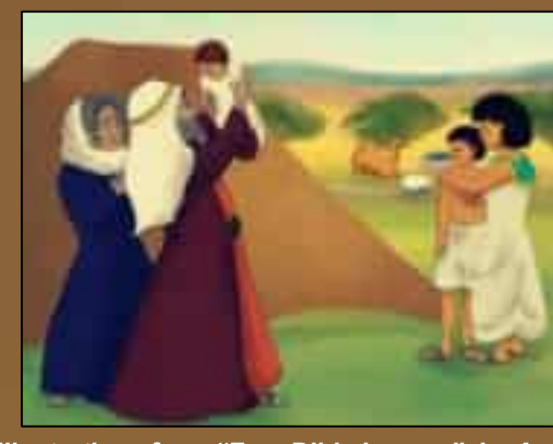
Illustrations from "Free Bible Images", by Amy & Carly – Fishnet Bible Stories