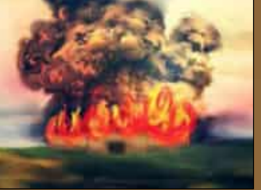
Illustrations from "Free Bible Images", by Amy & Carly – Fishnet Bible Stories