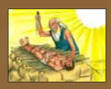
Illustrations from "Free Bible Images", by Jim Padget