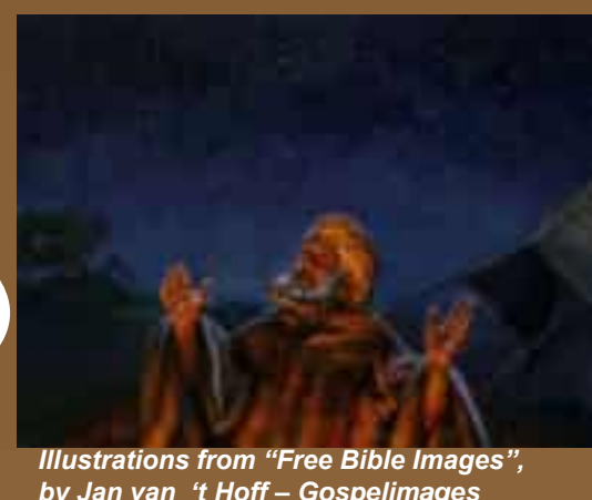
by Jan van 't Hoff - Gospelimages

"Circumcision was the 'token of the covenant' (17:11). This token makes the Abrahamic Covenant appear, at first glance, to carry a condition – the condition of circumcision. Actually, the Abrahamic Covenant is unconditional in its operation, but, for a person to enter its blessings, circumcision is required.