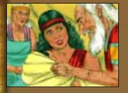
Illustrations from "Free Bible Images", by Jim Padget