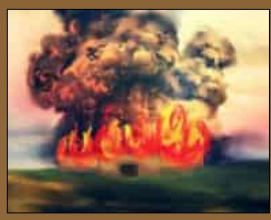
Illustrations from "Free Bible Images", by Amy & Carly – Fishnet Bible Stories