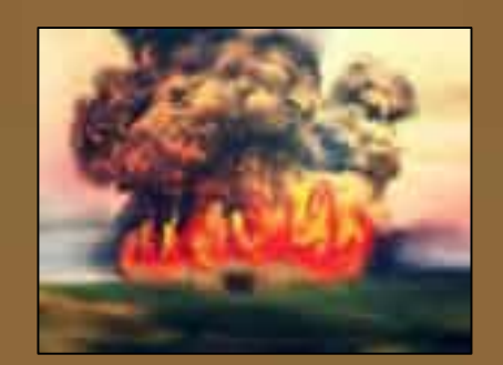
Illustrations from "Free Bible Images", by Amy & Carly - Fishnet Bible Stories