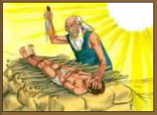
Illustrations from "Free Bible Images"

Genesis 22:1 And it came to pass after these things, that God did tempt Abraham, and said unto him, Abraham: and he said, Behold, here I am..