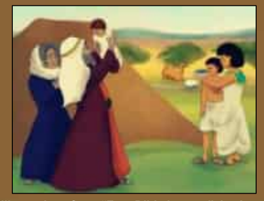
Illustrations from "Free Bible Images", by Amy & Carly – Fishnet Bible Stories

"One of the most difficult lessons of faith to learn is that of the times of God.