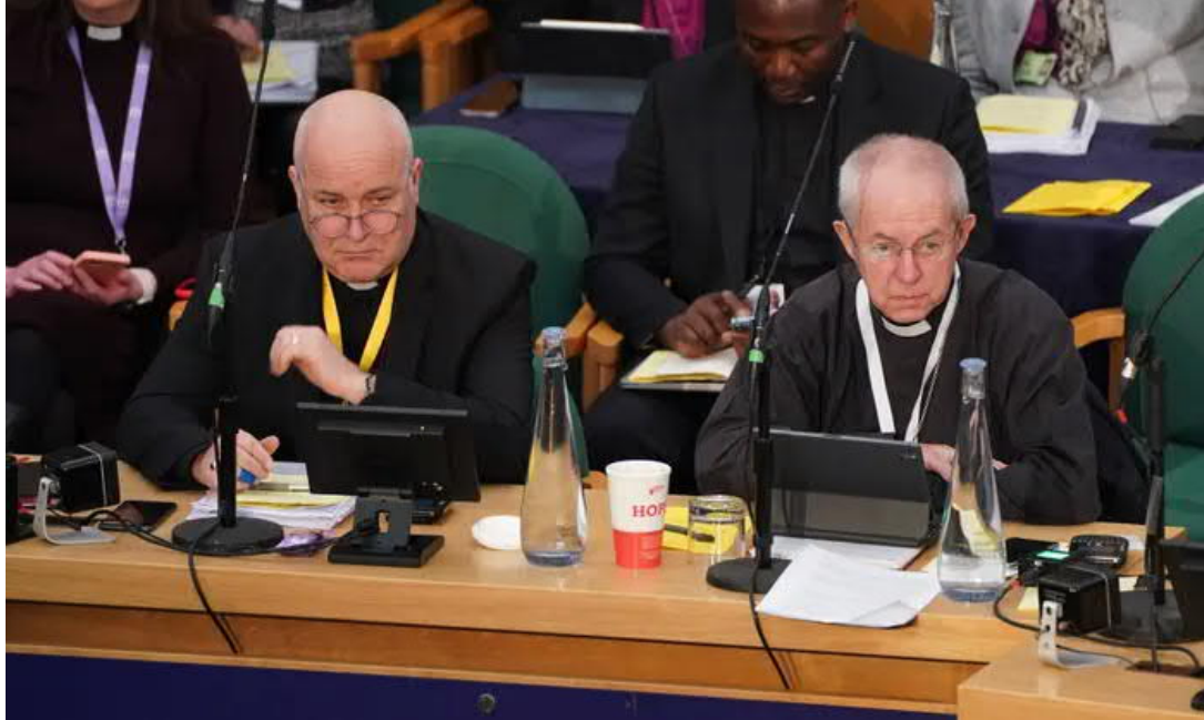
📷 The archbishop of York, Stephen Cottrell (left), and the archbishop of Canterbury, Justin Welby, at the General Synod on Thursday.

Passing of motion at General Synod represents profound shift in church's stance on homosexuality