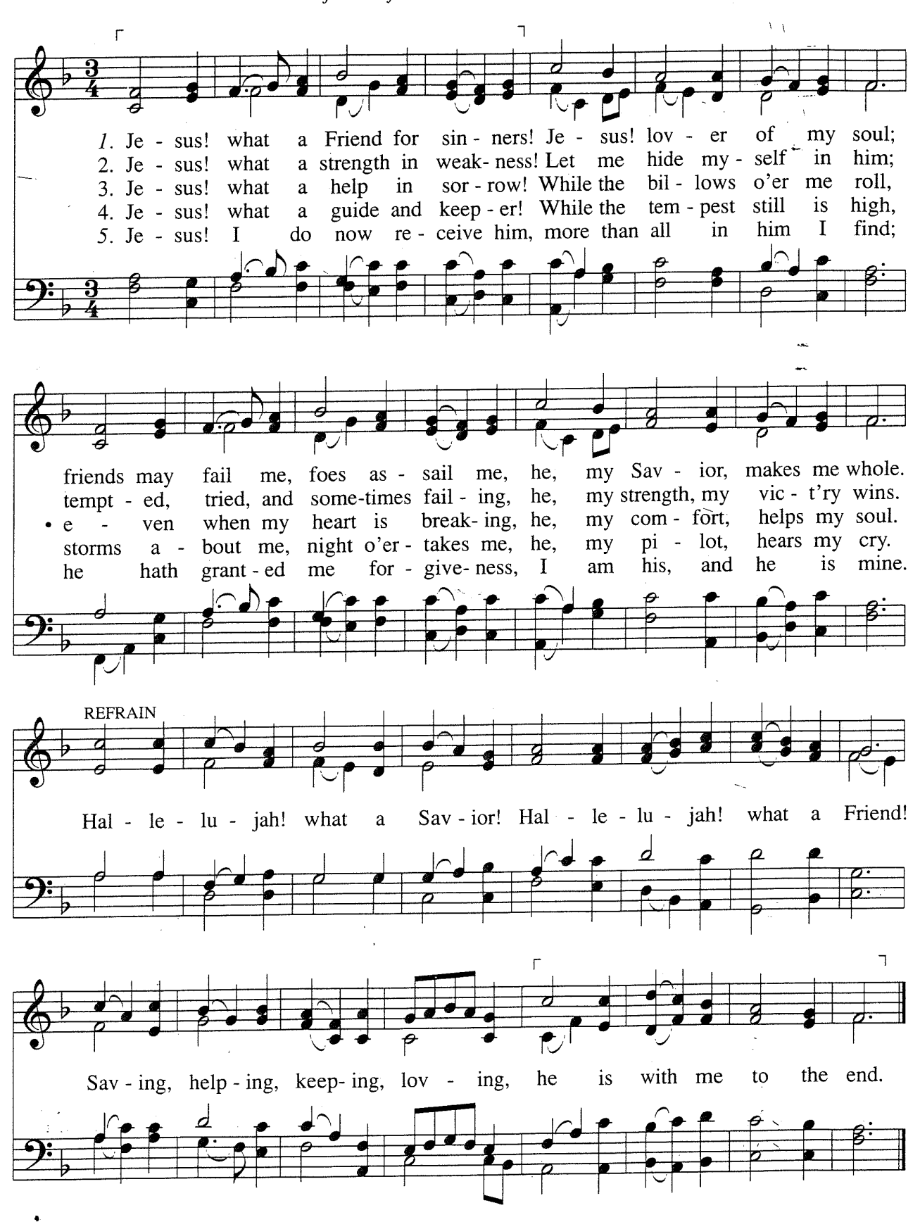
A friend of ... "sinners." Matt. 11:19