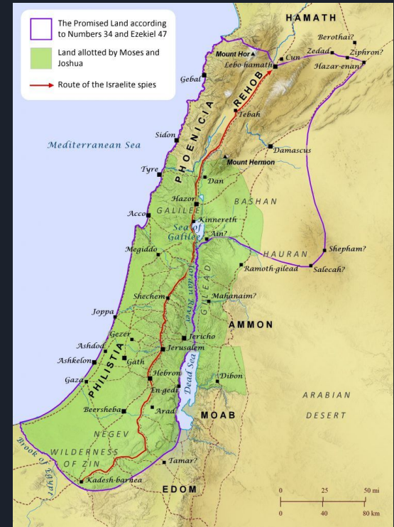
Promised Land & Nation