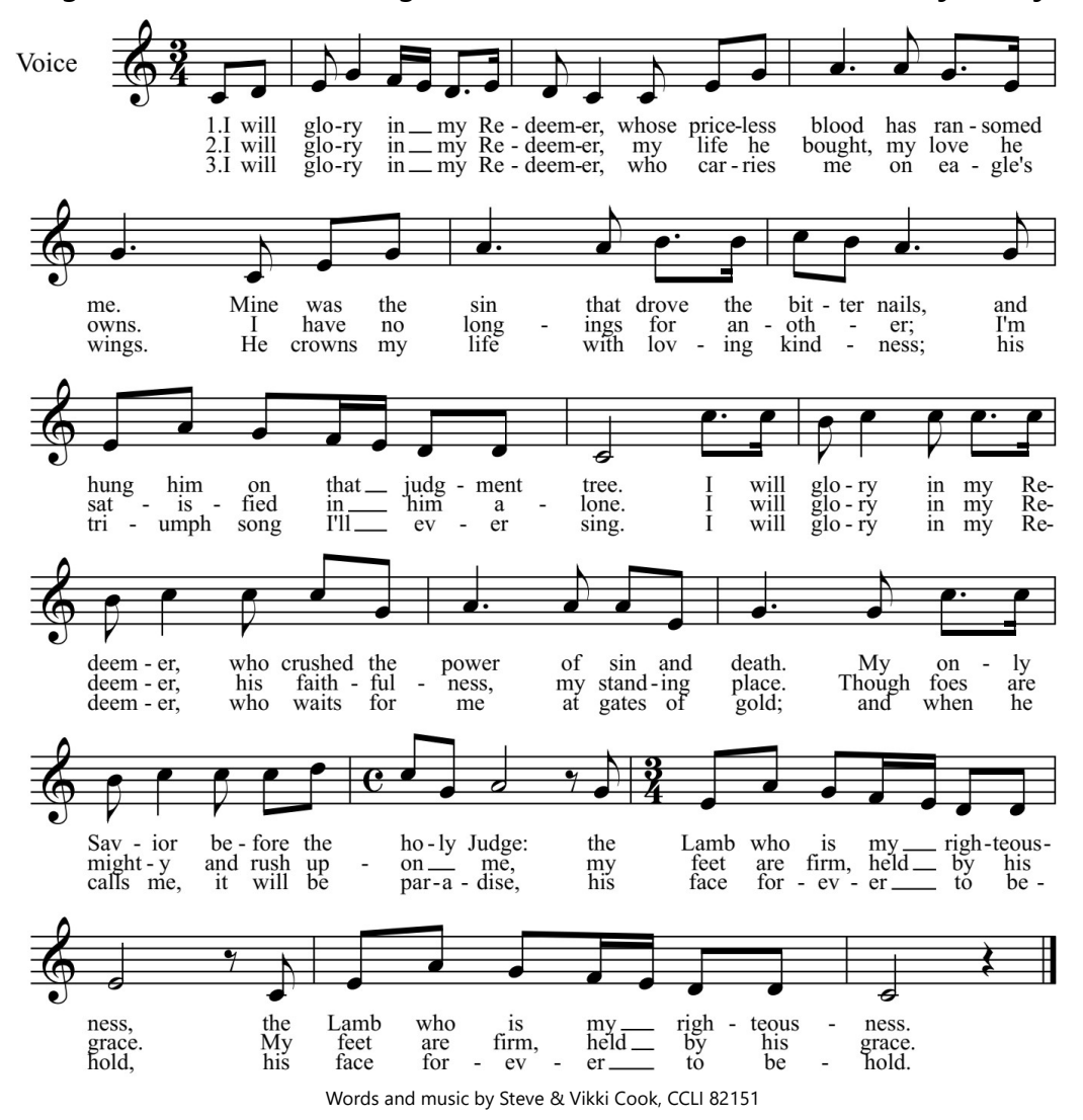
* Responding to God's Grace in Song