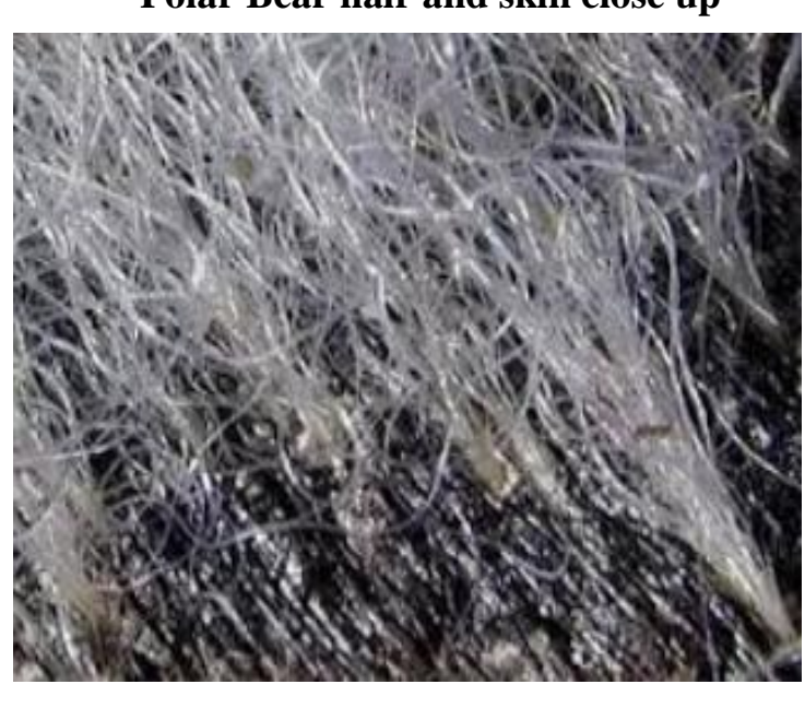
Polar Bear hair and skin close up