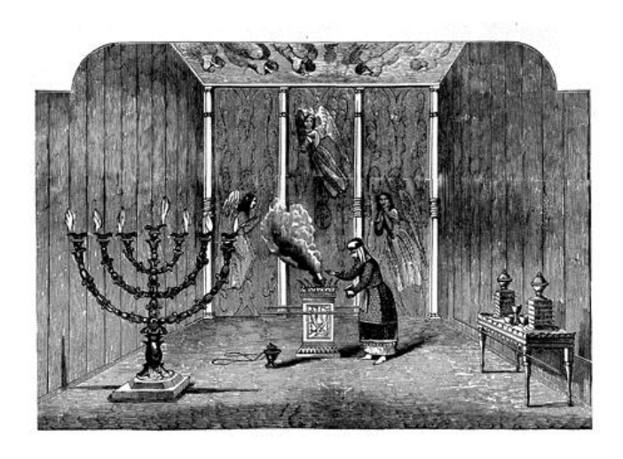
The Holy Place