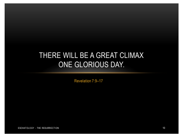
Freeze this slide on the the front screen

After this I looked, and behold, a great multitude that no one could number, from every nation, from all tribes and peoples and languages, standing before the throne and before the Lamb, clothed in white robes, with palm branches in their hands, and crying out with a loud voice, "Salvation belongs to our God who sits on the throne, and to the Lamb!" And all the angels were standing around the throne and around the elders and the four living creatures, and they fell on their faces before the throne and worshiped God, saying, "Amen! Blessing and glory and wisdom and thanksgiving and honor and power and might be to our God forever and ever! Amen."