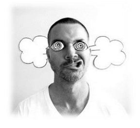
III. The _____ God Promises