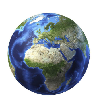
Pray that we may make Disciples of the Nations.