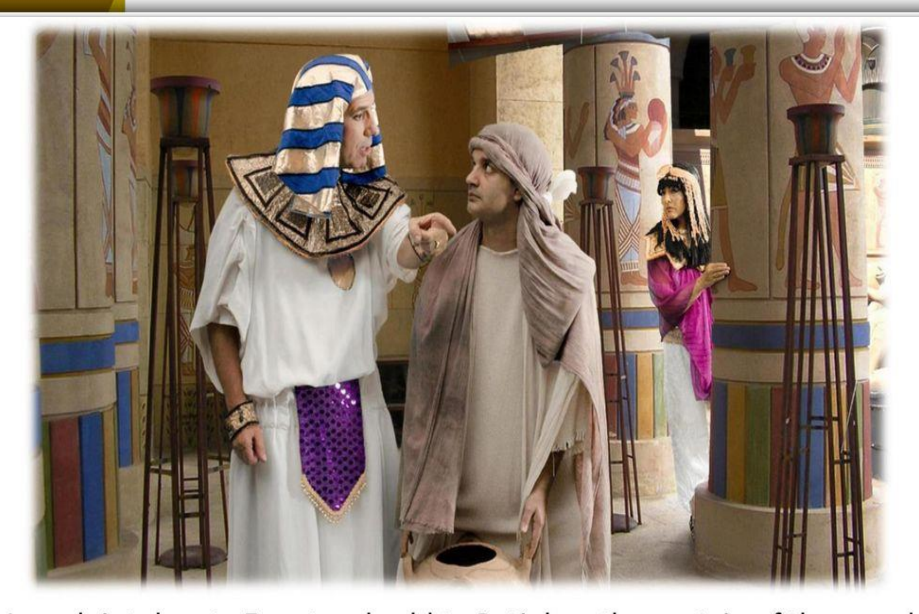
Joseph is taken to Egypt and sold to Potiphar, the captain of the guard