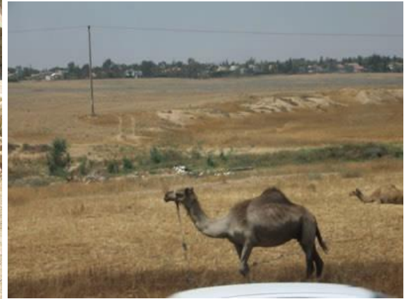
Camel in fields outside Beersheba