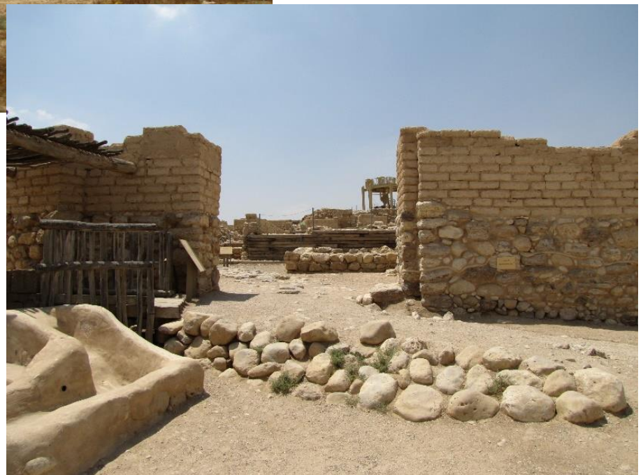
The Gate of Beersheba with the well to the left