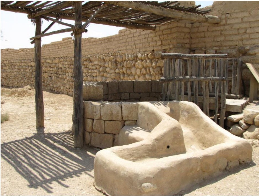
Well at the gate of ancient Beersheba