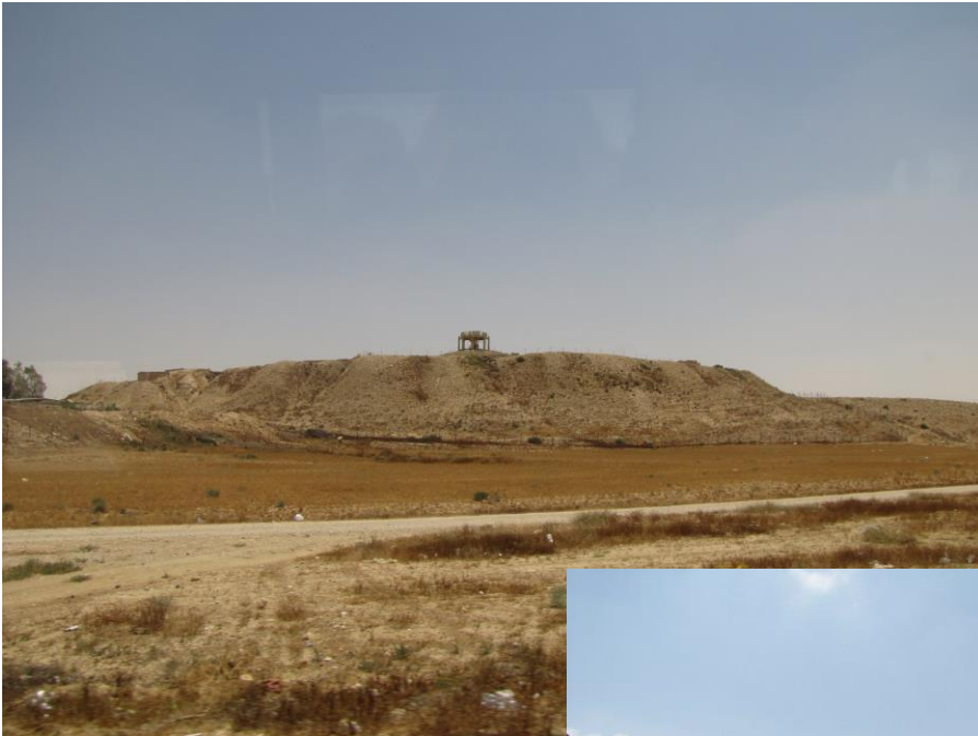
Beersheba – the ancient tell