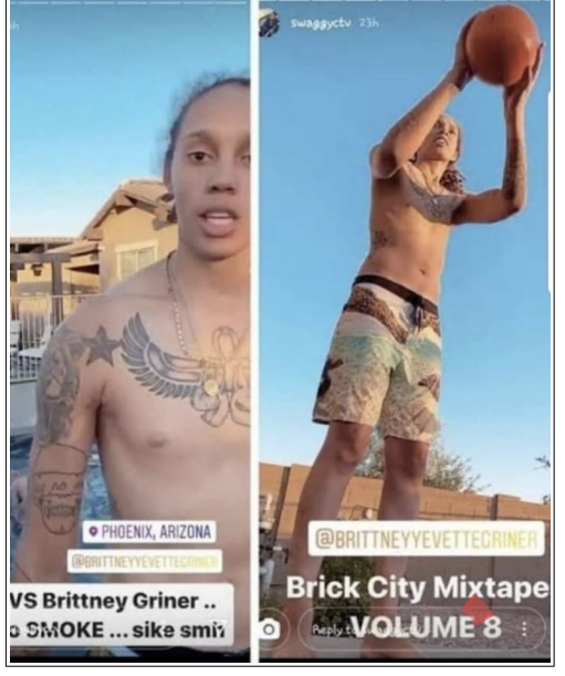
Supressing the truth? Looks like WNBA's Brittney Griner is a man.