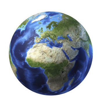
Pray that we may make Disciples of the Nations.