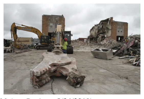
Demolition – 2019