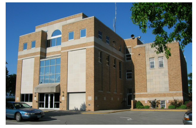
View from Southwest – 2008