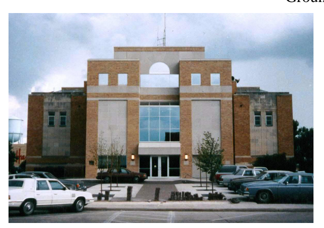
West Elevation – 1992