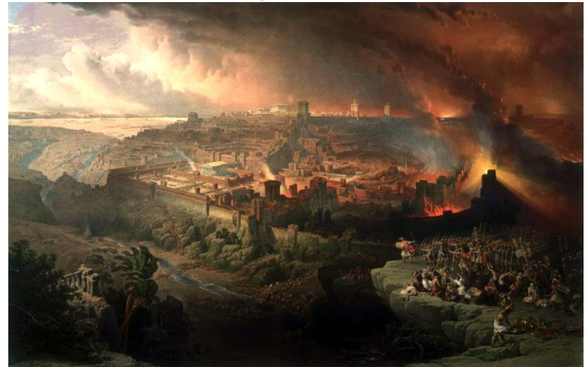
The Siege and Destruction of Jerusalem by the Romans Under the Command of Titus, A.D. 70, by David Roberts (1796-1864)

Christ's coming will destroy all who raised themselves against him and will return them to the state of divine abandonment. This man of iniquity can be interpreted either simply as the antichrist, or as the image of Caesar which Pilate put in the temple, or as the statue of Hadrian the equestrian which still today stands in the Holy of Holies. Because the Old Testament normally calls the abomination an idol, the word desolation is added here to indicate that the idol shall be placed there resulting in the temple's abandonment and destruction.