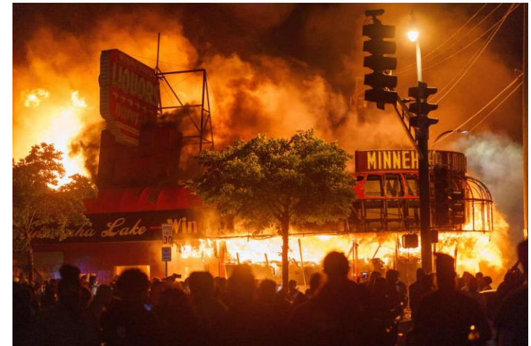
Destroyed City (Picture of Lake Street in Minneapolis on 5/31/20)