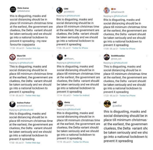
Figure 1 - Leftwing Bots are allowed on Twitter

Abiding in Christ is, in fact, the natural result of receiving salvation. To continue abiding in Christ, effort on our part must be made, just as effort is needed in our human relationships. It's not difficult to get to know other human beings, is it? We learn quickly if that other person is a "right" fit for us as far as friendship or even romance. If not, we might