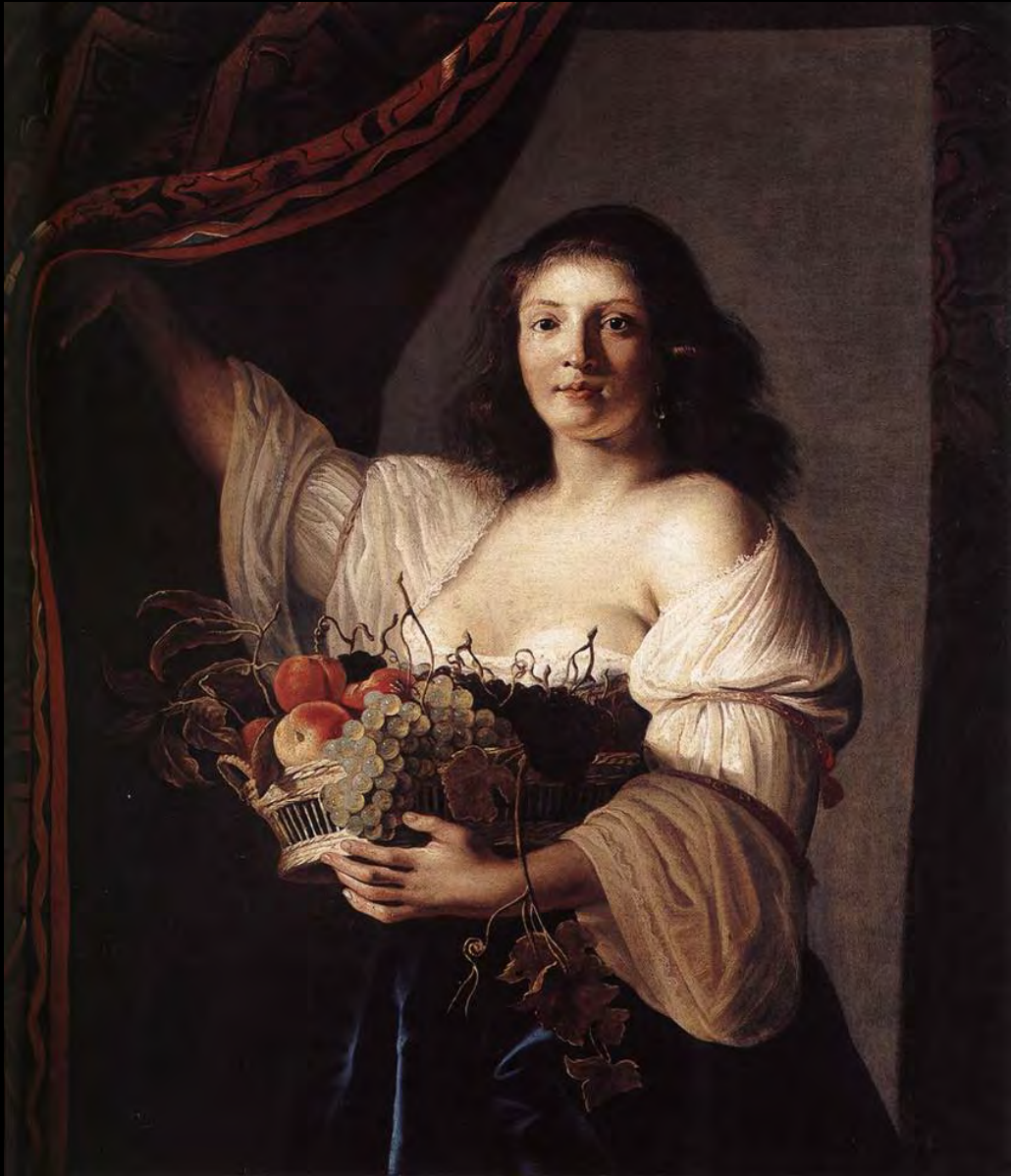
Woman With a basket of Fruit by cab Couwenbergh cir. 1641