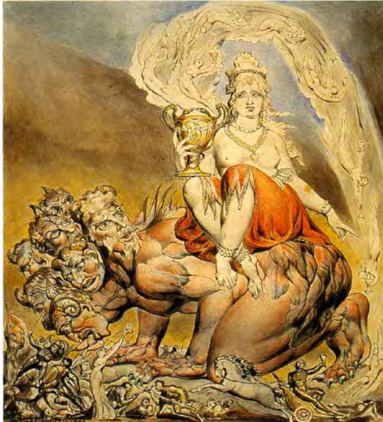
The Whore of Babylon by William Blake cir. 1809