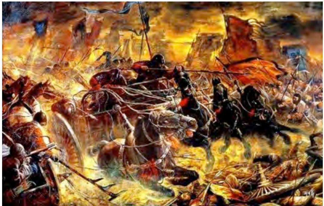
The Battle of Chariots

The red horses symbolize war and bloodshed as in: