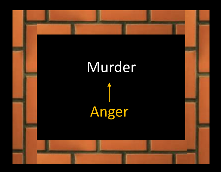
2 Corinthians 5:17