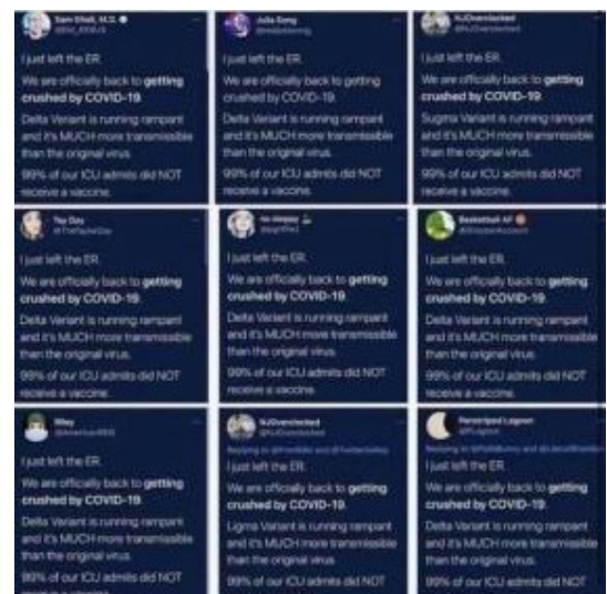
This image and the one below shows more Twitter "bots" spreading messages of fear, paranoia and fascism.