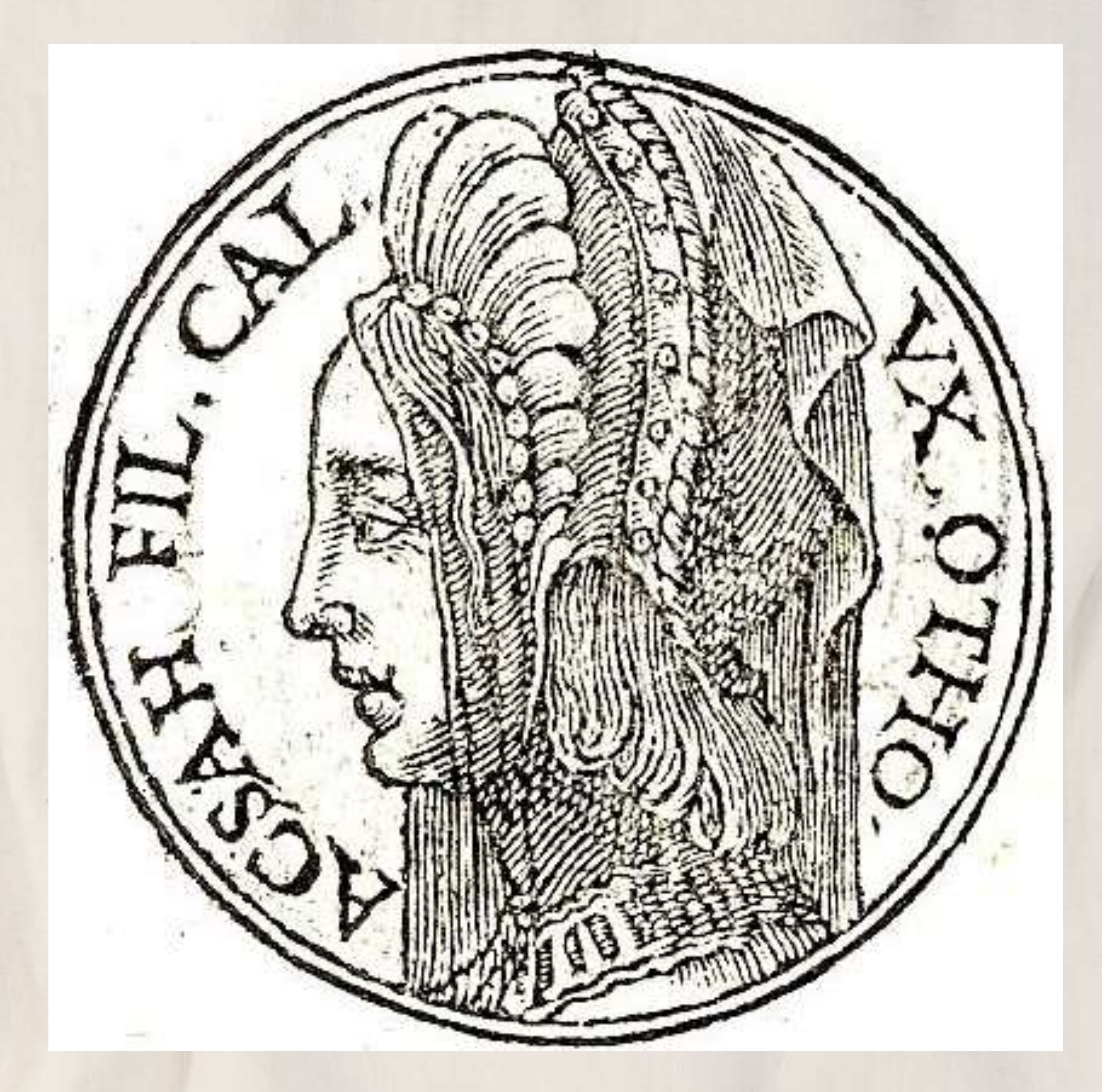
Medallions of the Most Famous People, 1581 commons.wikimedia.org