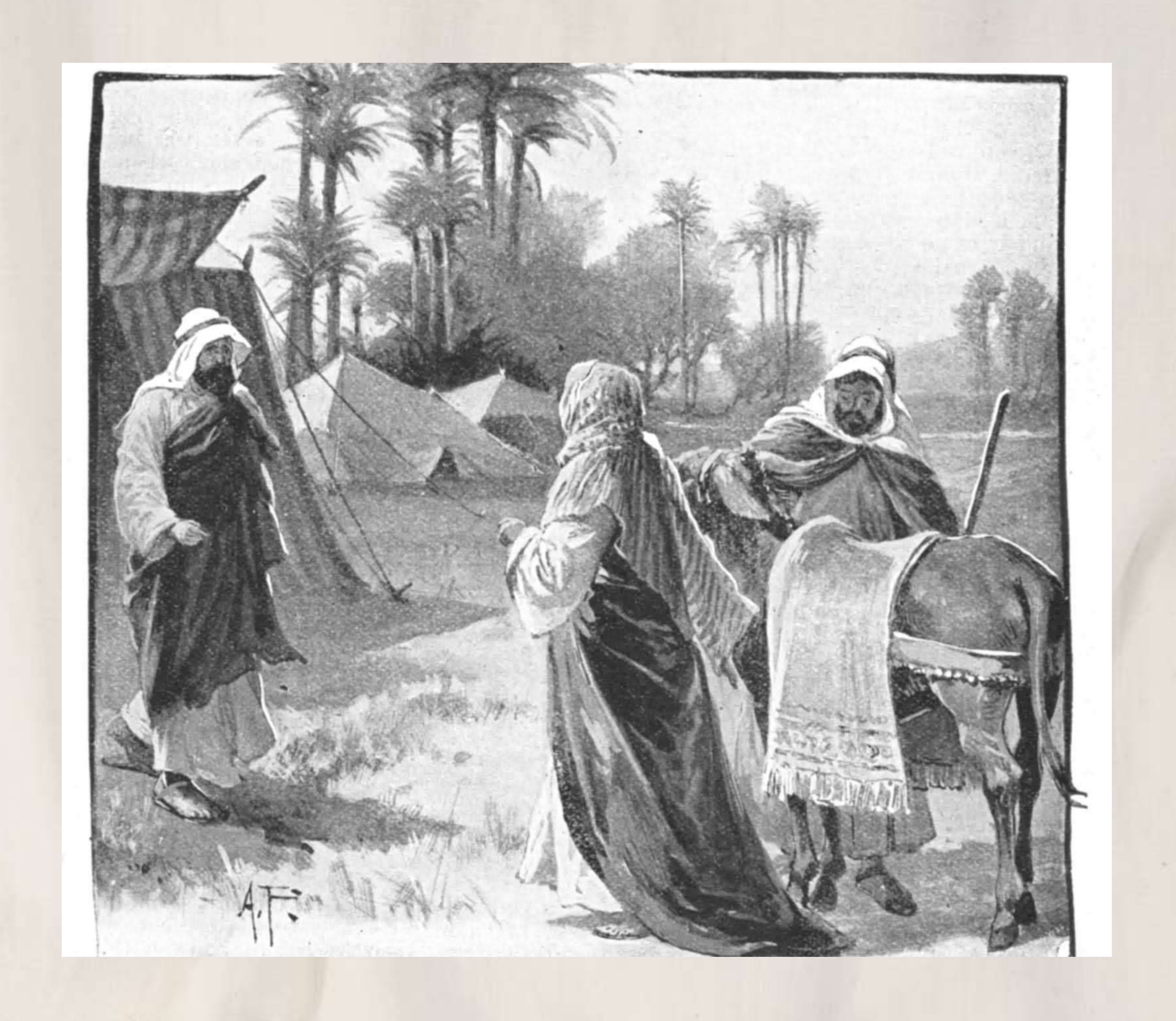
From The Art Bible, published 1896