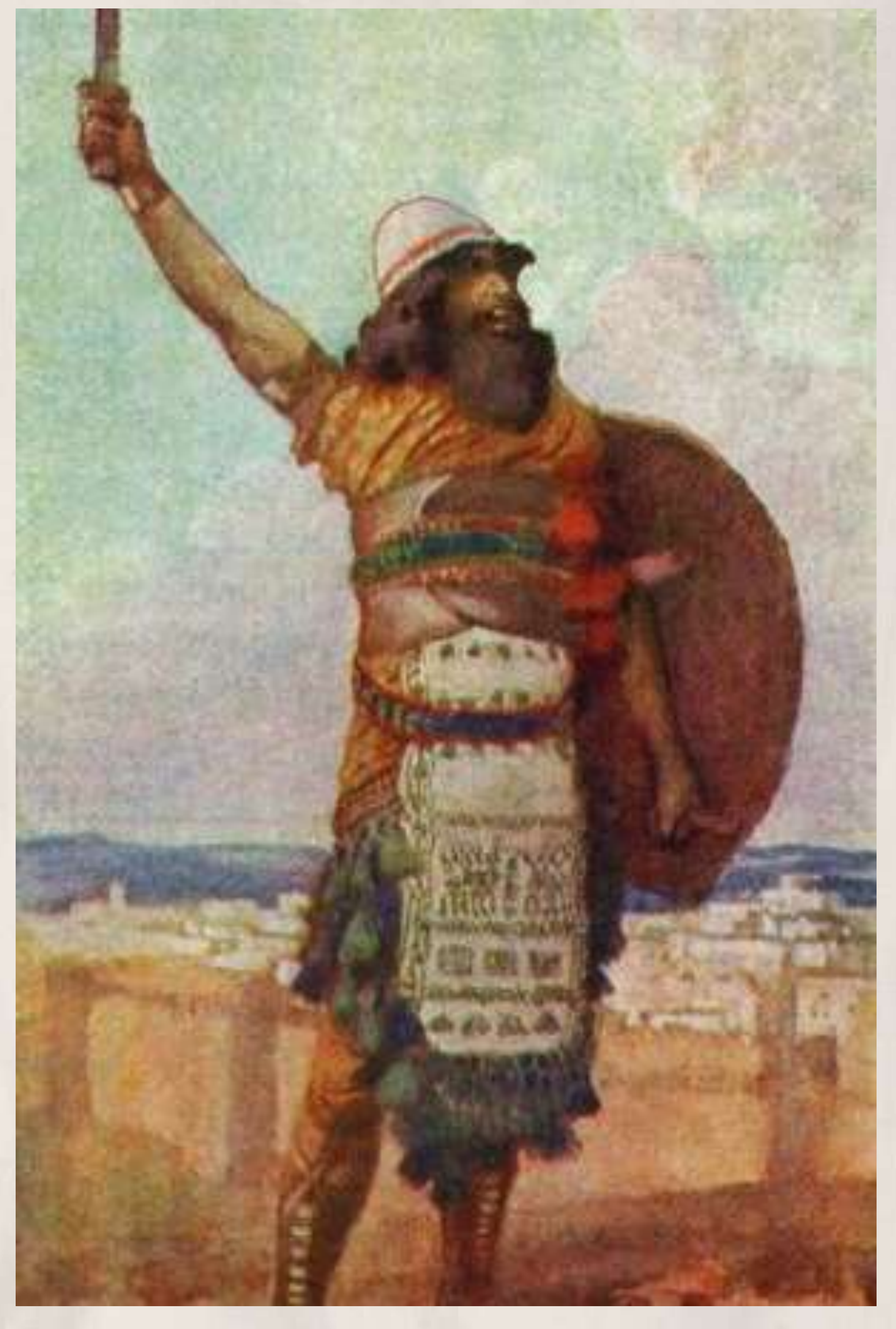
Othniel by J James Tissot, 1890's Jewish Museum, New York

"The Spirit of the Lord came upon him, and he judged Israel."