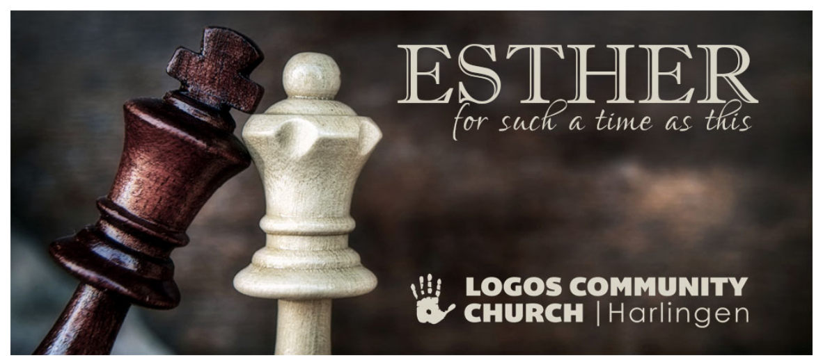
Who Has Power? Esther 1:1-12