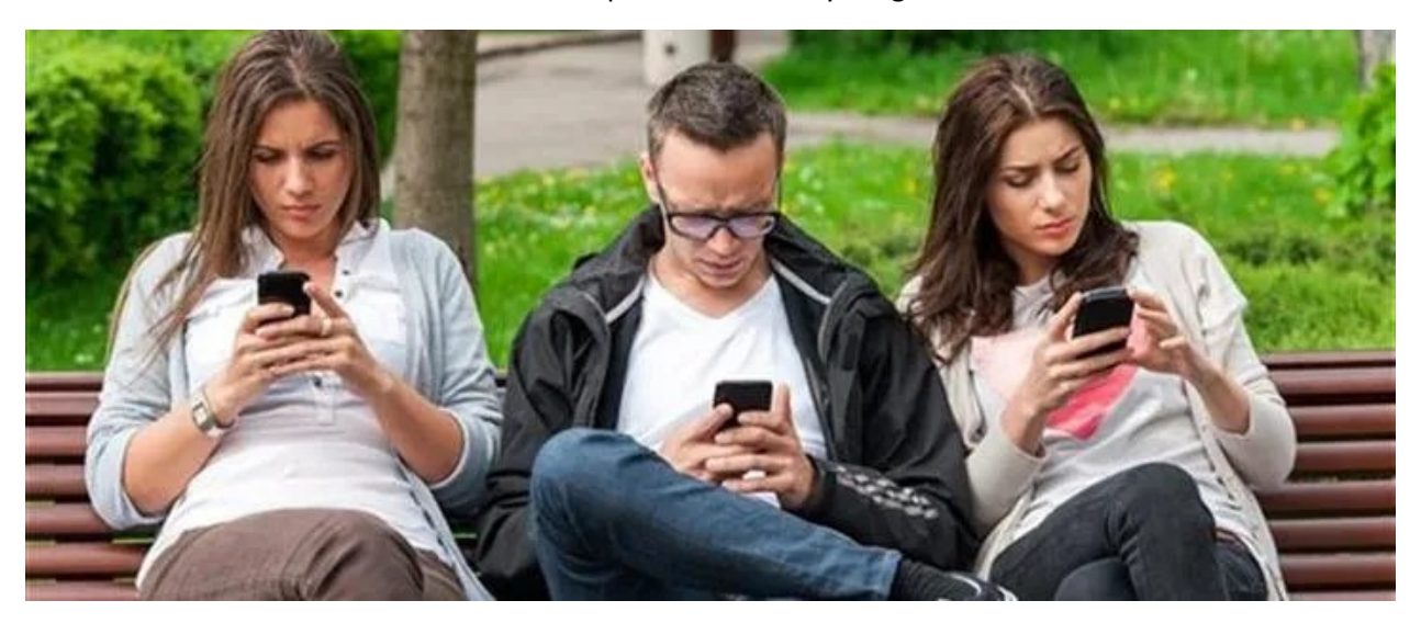
What have we become?

We can reject things like digital vaccine passports and digital currencies. Keep and carry cash and pay for some things with cash or check instead of debit card or some online code requiring your phone. In fact, leave your phone at home at times. Practice being without it here and there. The more you are tied to your phone, the more you are in their system. We have the ability to simplify our life but it will take effort because we are too habituated to our phones and everything related to that.